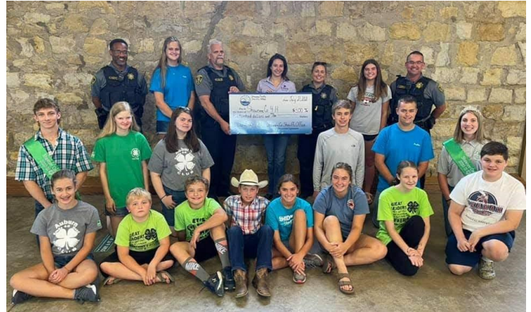
Our 4-H'ers receiving a donation from the Shawnee County Sheriff's office for our Annual Pancake Feed. Our fundraising committee worked hard this year and doubled the event's profit!

Emotional health is a part of physical health. Meeting the needs of youth to belong, master a project and be independent is an important part of keeping our young people happy and healthy. 4-H is designed to meet those needs!