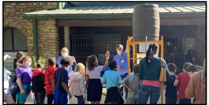
SCEMG volunteers teach students about water conservation and growing vegetables at the 2021 Topeka Water Festival.

The Garden Problems webinar series taught by Shawnee County Extension Master Gardeners and K-State Specialists taught gardeners the best practices for controlling nuisance wildlife, insect pests, invasive plant species and diseases and environmental issues in lawns.